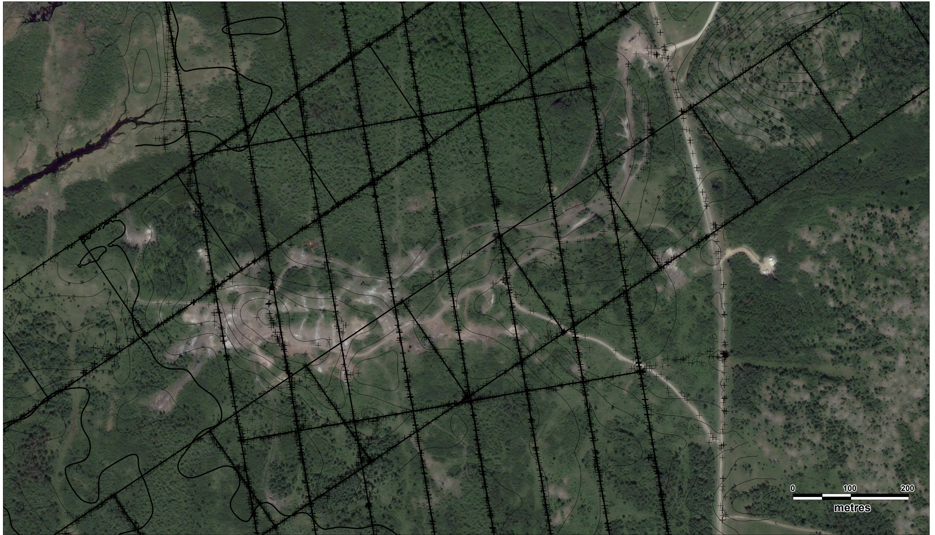
ARCHER LEVELLED TRACK POINTS (UNFILTERED) WITH SATELLITE IMAGERY